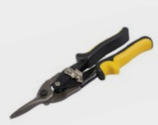
STRAIGHT CUT TIN SNIPS