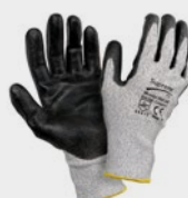
CUT LEVEL 5 SAFETY GLOVES