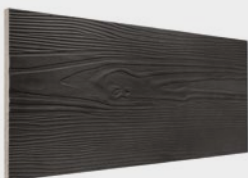
FIBRE CEMENT LAP CLADDING BOARDS