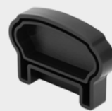
BALUSTRADE END CAP