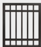
BALUSTRADE HANDRAIL GATE