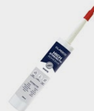
CLADCO HIGH STRENGTH ADHESIVE