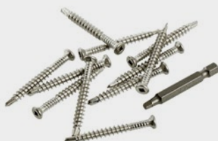
SPEEDDEKZ 316 STAINLESS STEEL SCREWS