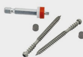
65MM HIDDEN DECK FASTENERS