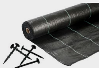
WEED MAT & PINS BUNDLE