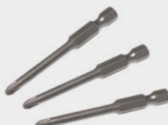
MAGNETIC PHILLIPS IMPACT SCREWDRIVER BITS